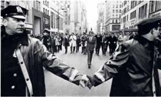
ROBERT F. KENNEDY LEADS NYC ST. PATRICK'S PARADE IN 1968