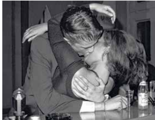
"BERLIN KISS" 1996, BY HARRY BENSON

This question is particularly relevant in a time when the line between reality and performance is increasingly blurred. Benson's portrayal of celebrities like Muhammad Ali and The Beatles goes beyond their public personas, revealing the individuals behind the fame. His images prompt us to consider: What does it mean to be a celebrity? How do these figures navigate their identities in an age of relentless visibility?