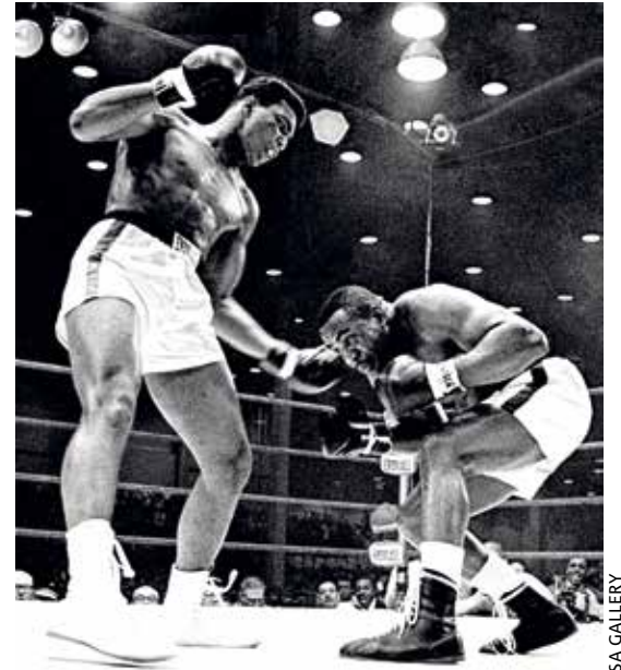
CASSIUS CLAY DEFEATS SONNY LISTON TO BECOME HEAVYWEIGHT CHAMP IN 1964, BY HARRY BENSON

As we consider the historical context of his images, we are prompted to explore questions such as: How does photography shape our un-